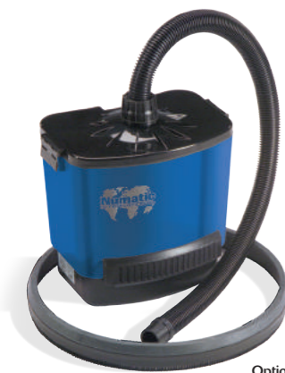
Optional Dustrol vacuum kit

The design characteristics for the HFT model echo all the many details of the Hurricane range but with the advantage of two speeds where required.