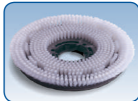
Light duty scrubbing/shampoo brush