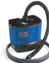
Optional Dustrol Vacuum kit