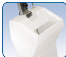
Large Solution Tank Option

All HFS models incorporate our ATC, Automatic Torque Control, monitoring and balancing operational power input throughout the cleaning cycle.