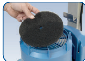
Optional Hi-Dust Motor Filter