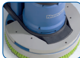
Optional 10Kg Additional Weight