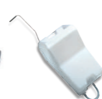
Optional Solution Tank