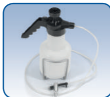
Optional Spray Clean System