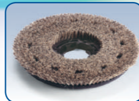
Union mix polish brush