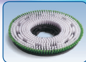
Heavy duty scrubbing brush

Our full range of machines is complemented by an extensive range of brush specifications in order to ensure the highest standards and optimum results in use and floors you will be proud of. (See FloorCare Accessory Catalogue)