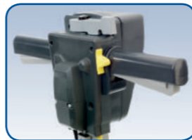
Simple operator control

Transmission of power to the floor is seamless via the long-life oil filled planetary gearbox resulting in superb handling characteristics.