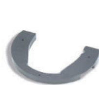
Optional 10Kg Weight