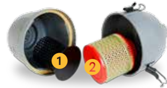
1 Coarse filter 2 HEPA finfilter Inline